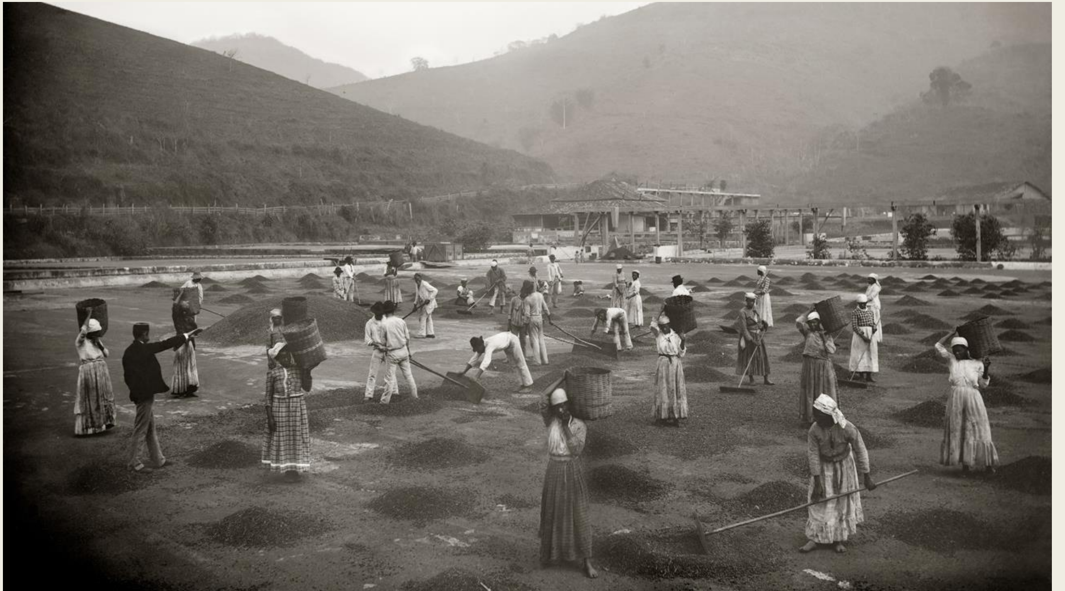
Slave on a coffee plantation near São Paulo, 1882